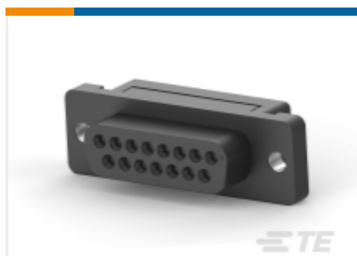
TE Part # CAT-AM7-253 IDC D-Sub: Receptacle Assembly, Low Profile, Signal, 2.77 mm